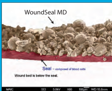
Actual scanning electron microscopy image

WoundSeal MD is not a vasoconstrictor or a cauterizing agent. The powder is not biologically derived and is non-toxic.